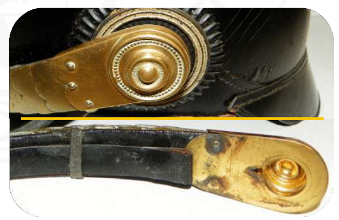
Figure 14: Example of officer's chin scale attachment M/15