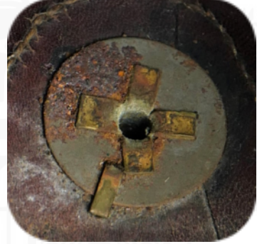
Figure 9: Example of an M/91 rosette fastening from the inside, with a pin as anti-twist device