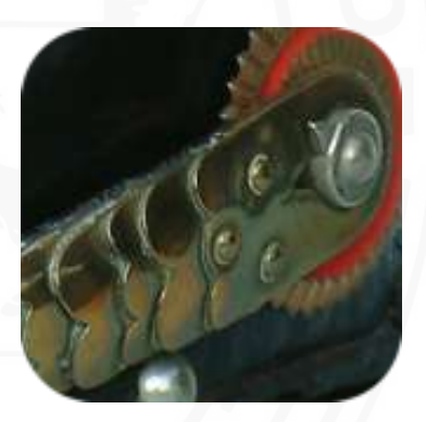
Figure 10: Curved chin scale with M/91 rosette