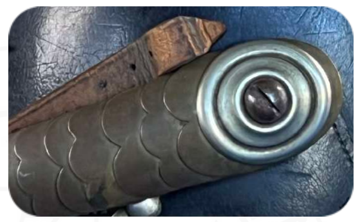
Figure 3: Curved chinscale with attachment of an M/71 of the FAR