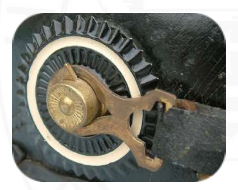
Figure 8: Chinstrap attachment M/91

Figure 7: Excerpt from "Bekleidungs-Ordnung für Mannschaften der königlich Preußischen Armee" - Part 2, from 1896