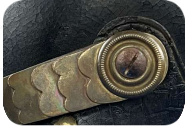
Figure 2: Flat chinscale with attachment of an M/71 (Collection SMH)